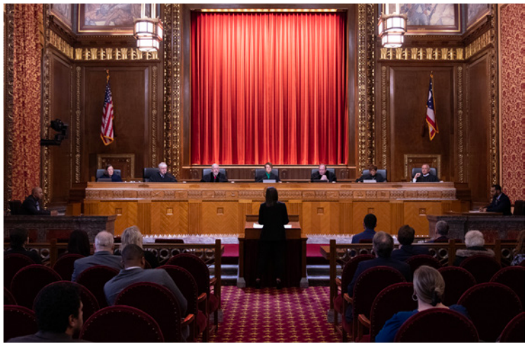
Counsel presenting an argument before the Court.

Participants in oral argument should wear appropriate business attire befitting argument before the Court.